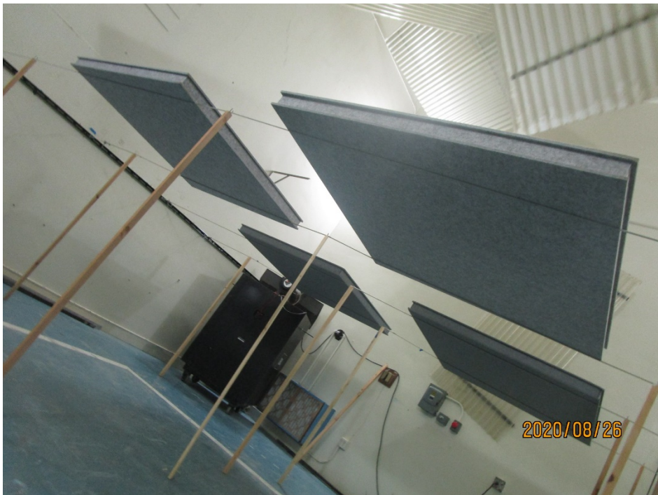
Figure 2 – Underside of specimen material in test chamber