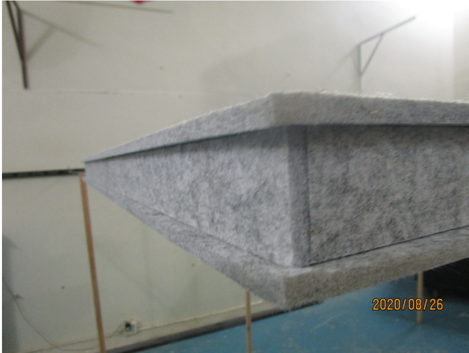
Figure 3 – Detail of specimen material